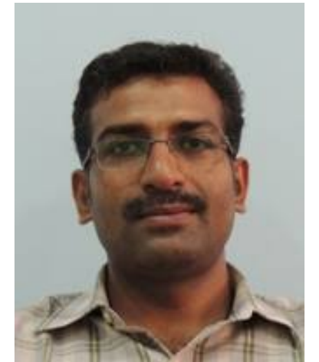
Bama P. Bag CSIR-IMMT Bhubaneswar